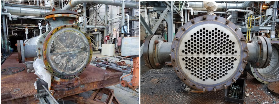
Figure 3. Exchanger prior to cleaning (left) and exchanger channel head removed, completely cleaned with NitroLance (right)

tube duration of cleaning ranged from three to five minutes, depending on the severity of the obstructions. Bare metal was visible after cleaning which is the best result of all.