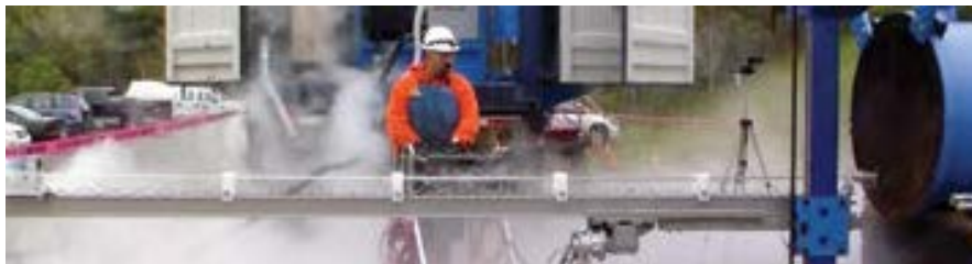
Figure 2. NitroLance can be equipped for hands free operation to provide additional safety

For this application, the plant and Conco opted for the NitroLance hands free operating system. The upgraded NitroLance system consists of an X-Y indexer that is controlled with pneumatic motors that drive the mounted Z-axis rail left, right, up or down. The controls for the system can be performed by one technician from a control stand and at a safe distance from plant equipment and operations.